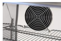
Recirculating internal fan