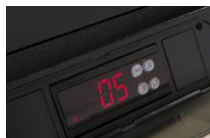
0 – 10 degrees electronic temperature control