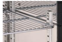
Chrome adjustable shelves